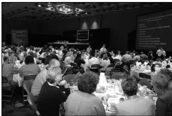
NASFAA Conference luncheon session