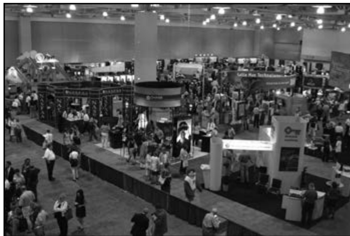
NASFAA Conference Exhibit Hall.

The National Leadership Conference took place in Washington, D.C. or its immediate vicinity in early March each year. It served as a training session for current or prospective state and regional association leaders and certain members of Board of Directors.