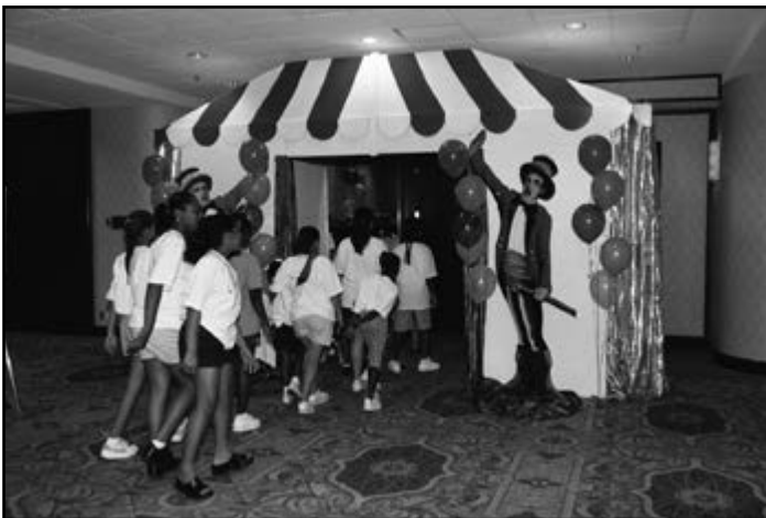
Children arrive, eager for the start of the DMCI Carnival of Learning event.

In 1999, the Board learned that the breakfast would address matters relating to diversity and leadership. (Minutes: NASFAA Board of Directors, Nov. 15-17, 1999.) The broader consideration of the issues desired by the DMCI would be accomplished by interest sessions during the conference. Minority members of NASFAA, the Board of Directors, presidents of the state and regional associations and the past national presidents and chairs were all invited to the Minority Leadership Breakfast in 2001. (Minutes: NASFAA Board of Directors, April 29-May 2, 2001.) In addition, two of the five interest sessions proposed by the DMCI for the 2001 conference were accepted. One session dealt with college savings plans and the other with TRIO and Gear-Up relationships.